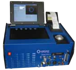
ORBIMAT 165 CA