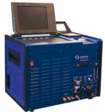
ORBIMAT 300 CA