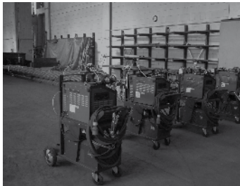
Automatic programming which generates welding parameters by entering the tube diameter, wall thickness, material and welding gas.