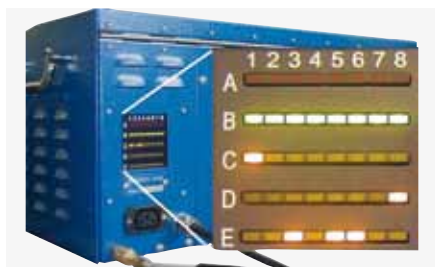
PSS Pro-Service System: Simple functional test with no need to open the unit