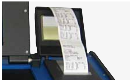
Integrated job printer allows actual values to be printed out