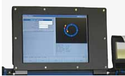
Clearly laid-out 10.5" swivel monitor