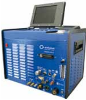
ORBIMAT 300 CA AC/DC