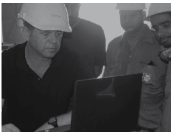
Swivel mount 10,5" colour with multilingual menu navigation via color display.