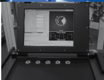
Capacity to store over 5,000 welding programs.