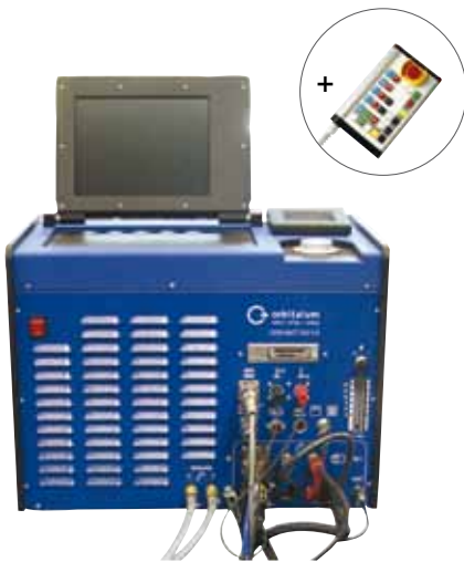
ORBIMAT 300 CA AVC/OSC incl. remote control