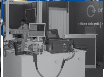
Simple and convenient operation thanks to multifunctional rotary actuator.